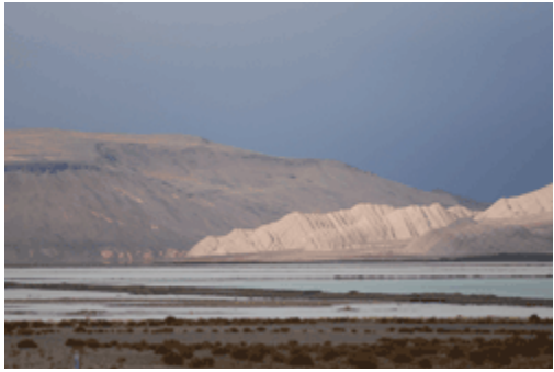
FMC's operations at Salar del Hombre Muerto, Argentina