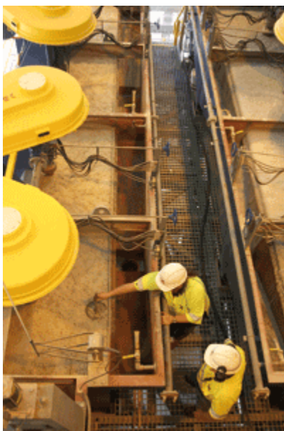
Lithium concentrate plant at Talison's Greenbushes operation in Western Australia

"We have reached peak oil and therefore expect future higher prices of oil. Further, the recent unrest in the Middle East and ensuing higher oil prices may accelerate development of the electric vehicle markets," she added.