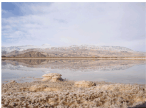
The site of Chemetall's lithium project in Silver Peak, Nevada

As the era of electric vehicles draws closer, the lithium supply industry is positioning itself for an anticipated boom in demand. But disparities in the various market forecasts mean the future is anything but certain for the growing number of emerging suppliers