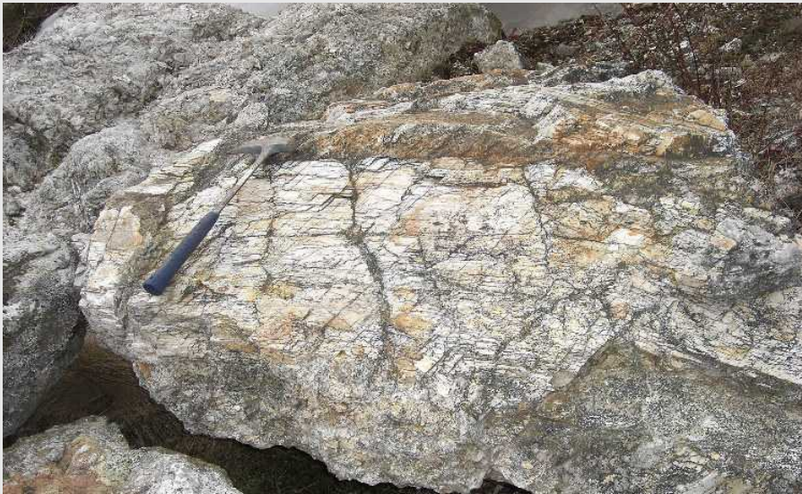
Giant Spodumene Crystal

Mined by Traditional Hard Rock Methods (Open Pit)