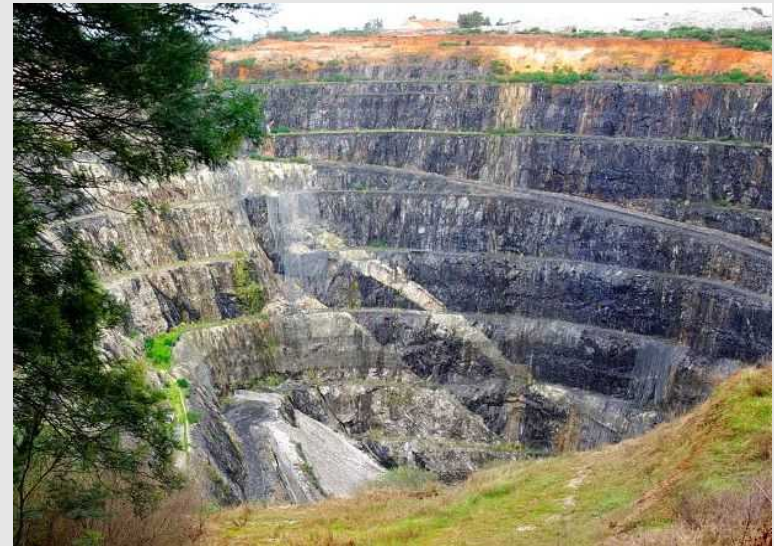
Greenbushes Open Pit Mine